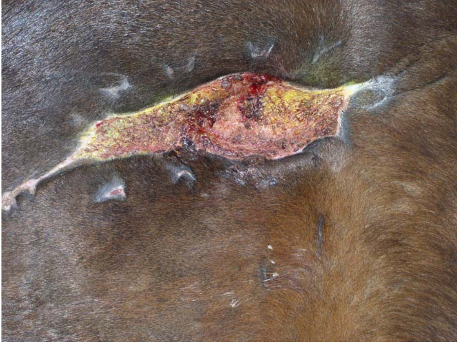
Figure 5. 3-30-04 After three weeks of MET treatment was completed.