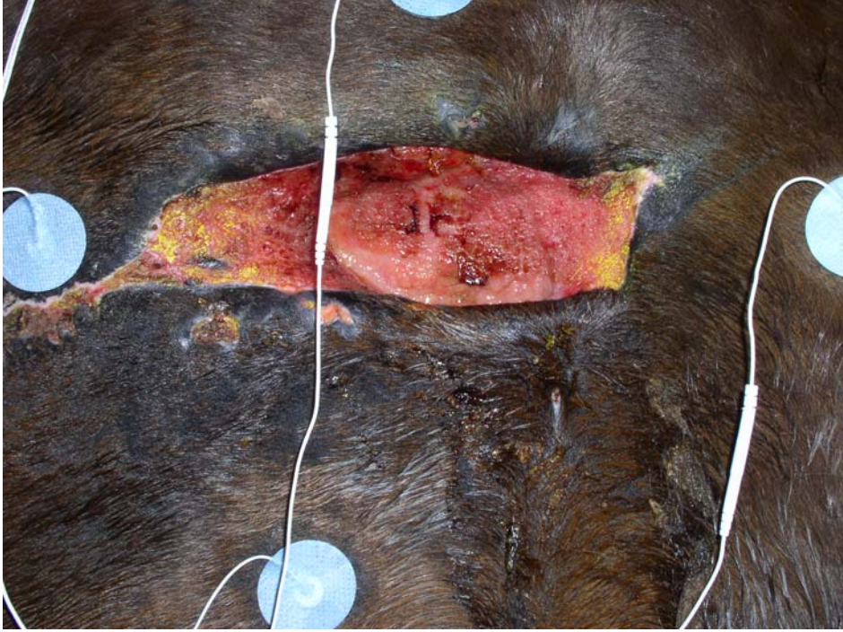
Figure 3. 3-18-04 Ten days of MET showing substantial healing and a clean wound.