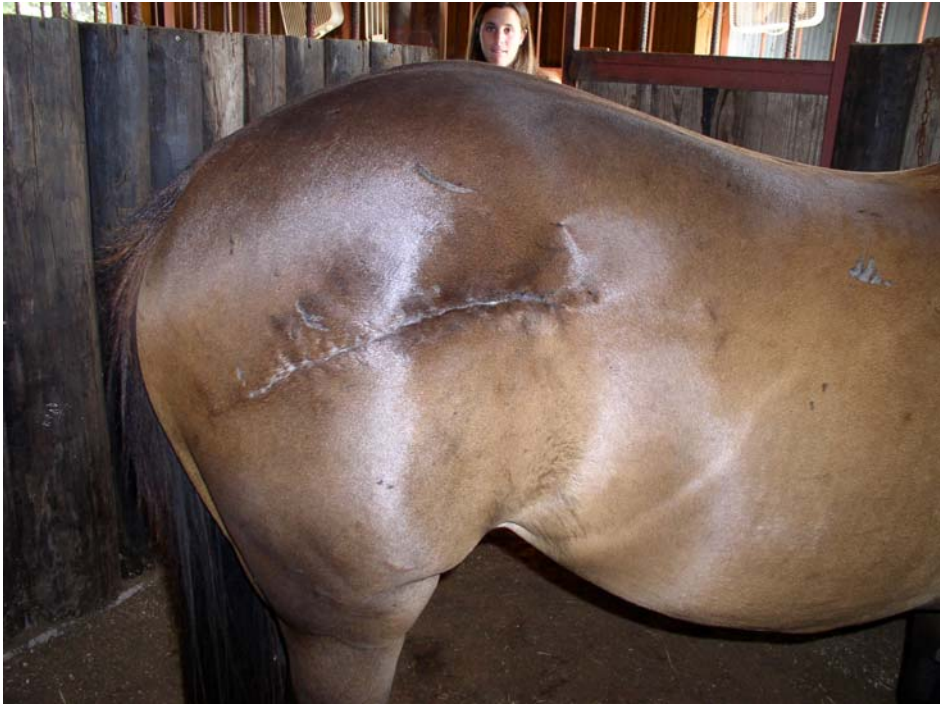
Figure 6. 7-1-2004. The horse was returned to training.