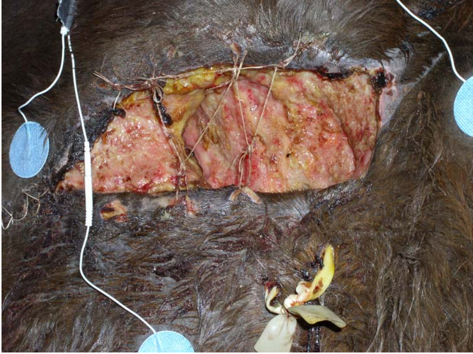
Figure 1. 3-8-2004. One month post wound, at initiation of MET therapy.